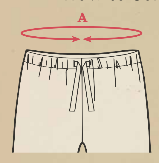
Step 1 – Measure your waist to Find 'A'

Measure your waist and ensure the measurement falls within the indicated size guides on the chart.